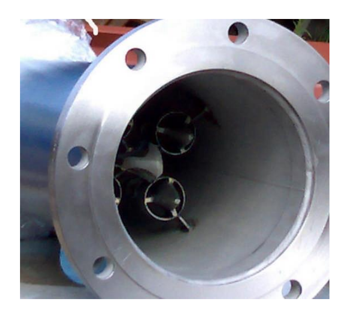
An internal view of a MagCat